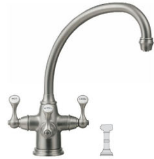
Traditional TFT 380