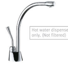
Little Butler™ LB 1000

Hot water dispenser only. (Not filtered)