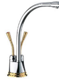
Little Butler™ LB 2009