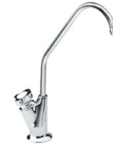
Uniflow DW 100

Hot water dispenser only. (Not filtered)