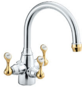
Tradition/Bathroom TFB 309