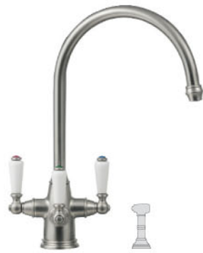
Corinthian TFC 380