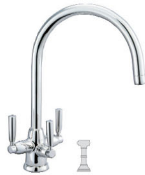
Contemporary TFN 400